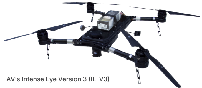
AV's Intense Eye Version 3 (IE-V3)