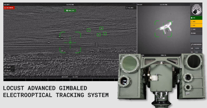
LOCUST ADVANCED GIMBALED ELECTROOPTICAL TRACKING SYSTEM