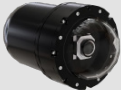
ULTRA 4K SMART CAMERA