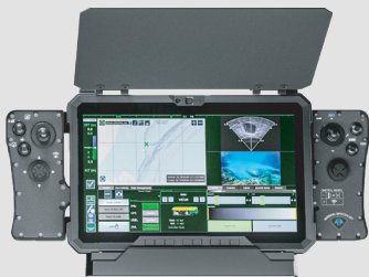
WORKHORSE CONTROL CONSOLE