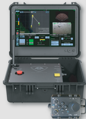
WORKHORSE SPLASHPROOF CONTROLLER