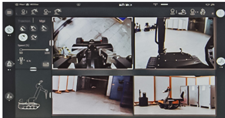
High-resolution multi-touch screen—multiple camera view options