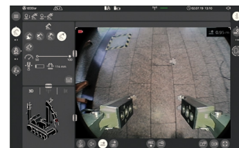
Real-time 3D avatar modeling—touch to access manipulator or camera feed