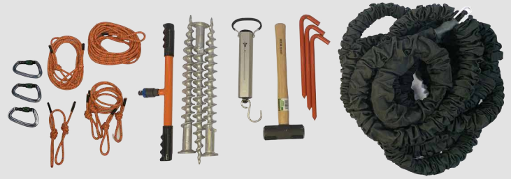
BUNGEE LAUNCH SYSTEM COMPONENTS