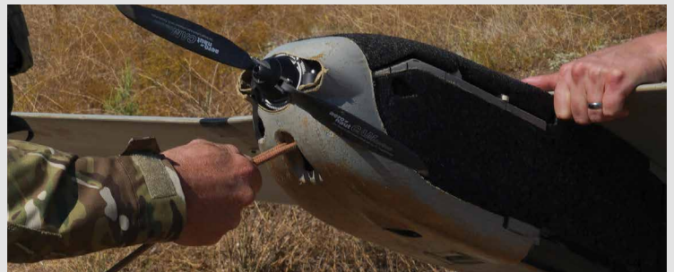
PUMA LE MOUNTING BRACKET