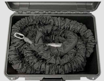
PACKED BUNGEE LAUNCH SYSTEM