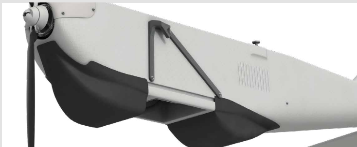
PUMA 2AE AND PUMA 3AE MOUNTING BRACKET

1. Zero wind conditions. Not recommended launching with a tailwind.