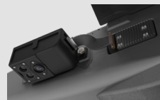
PUMA™ VNS (VISUAL NAVIGATION SYSTEM)