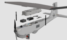
PUMA™ 3 COMMS RELAY