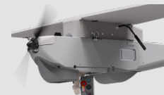
PUMA™ UNIVERSAL TRANSIT BAY