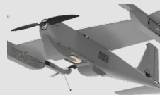
PUMA™ VTOL KIT