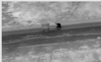
DOWNLINK IMAGERY FROM MANTIS™ i45 N