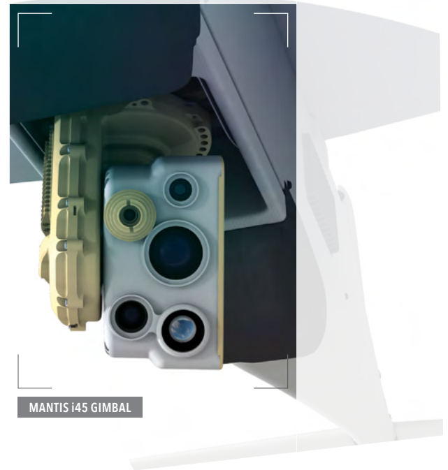
MANTIS i45 GIMBAL