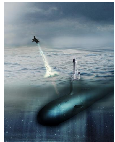
Blackwing Loitering Reconnaissance System

Initially developed for launch from submerged submarines or unmanned underwater vehicles, Blackwing could also provide reconnaissance capabilities for other naval vessels as well as land and air vehicles.