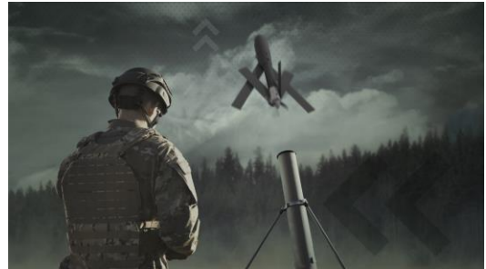
Switchblade 600 Loitering Missile System

operational in less than 10 minutes. Equipped with class-leading, high-resolution EO/IR gimballed sensor suite, precision flight control and more than 40 minutes of endurance, Switchblade 600 delivers unprecedented tactical reconnaissance, surveillance and target acquisition (RSTA). With a 115 mph dash speed and anti-