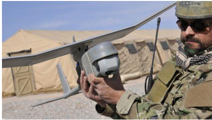
Raven - the World's Most Prolific SUAS

In the 1980s, AeroVironment created the first portable, hand-launched drone for information collection and transmission. Beginning in the 2000s, the company competed for and won every U.S. Department of Defense competition for tactical UAS programs of record. Today the company develops, supplies and supports an integrated family of tactical UAS for all military services within