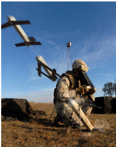
Switchblade 300 Loitering Missile System

The backpackable, battery-powered Switchblade 300 launches from a tube, unfolds its tandem wings and transmits streaming video from color and infrared video sensors directly to the