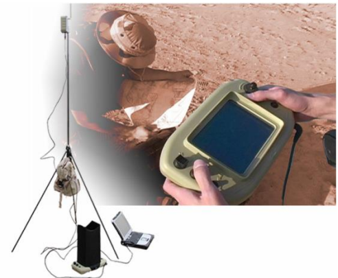
Common Ground Control System

AeroVironment's Ground Control System provides a common command, control and information solution for the company's family of tactical UAS. Small, lightweight, and combat proven, the Ground Control System enables the system operator to monitor and control the air vehicle while also displaying real-time video from its onboard cameras to personnel on the ground. In addition, it allows the operator to capture screen images and view other data, while also facilitating real-time re-transmission of video and metadata to an operations network.