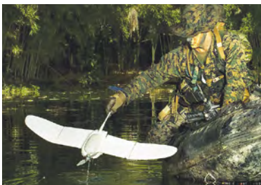
Wasp is landed and recovered in water

Wasp AE is the all-environment version of the battle proven Wasp III Micro Air Vehicle (MAV). With special design considerations for maritime and land operations, Wasp AE delivers exceptional features of superior imagery, increased endurance and ease of use that is inherent in all AeroVironment UAS solutions. This lightweight, unmanned aircraft system (UAS) is operated by AeroVironment's battle proven Ground Control Station (GCS). This common GCS is also compatible with Raven ® and Puma ™ AE.