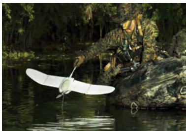
Wasp is landed and recovered in water

Wasp AE is the all-environment version of the battle proven Wasp III Micro Air Vehicle (MAV). With special design considerations for maritime and land operations, Wasp AE delivers exceptional features of superior imagery, increased endurance and ease of use that is inherent in all AeroVironment UAS solutions. This lightweight, unmanned aircraft system (UAS) is operated by AeroVironment's battle proven Ground Control Station (GCS). This common GCS is also compatible with Raven ® , Puma ™ AE, and Shrike VTOL ™ .