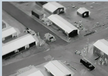
Downlink imagery from IR camera